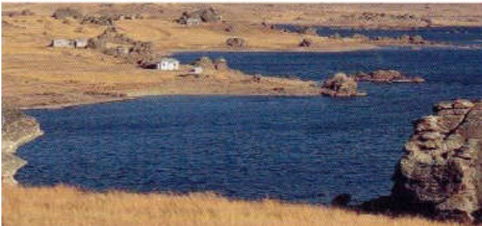
Fishing huts at Poolburn →

Drybread where the gravestones of those resting there tell of the harsh life endured by settlers and miners.