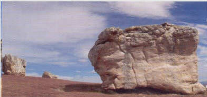
Known as Sarsen Stones on the North Rough Ridge →