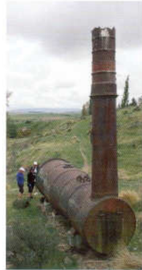
Golden Progress Mine →

Both valleys are dotted with mud brick and schist buildings built by the early settlers and preserved by the dry climate. Some are in ruins, but many are still inhabited or used as farm buildings.