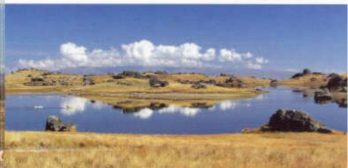
Poolburn Dam →

In winter the frozen Idaburn Dam is the venue for the famous Roaring Game, the ancient Scottish sport of curling. You might be lucky to catch a Bonspiel when curlers nationwide descend on Oturohua.