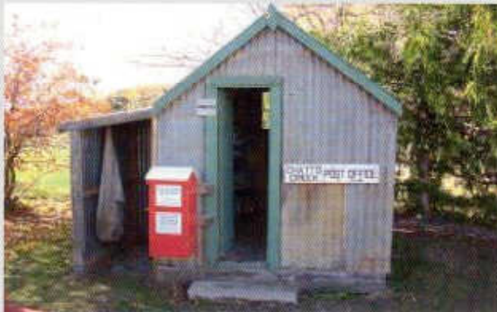
Chatto Creek Post Office →

For more details on where to stay, contact any of the local information centres.