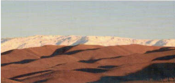
Tiger Hill and its changing colours →

Autumn blazes with a stunning palette of purple, gold, red, orange, and yellow, while sub-zero winters often bring hoar frosts which transform the countryside into an icy beauty.