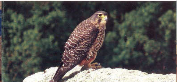
Karearea, New Zealand's Native Falcon →

Over the winter months when it is cold enough, there is plenty of action: enthusiastic curling teams gather on the Idaburn Dam near Otarehua while ice skaters flock to the Lower Manorburn and the Idaburn Dams.