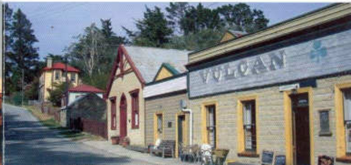
Vulcan Hotel, St Bathans →

Pioneering pastoral farmers also made their mark by breaking in the land despite inhospitable conditions. The tenacity of these tight-knit rural communities was recognised in 1912 when the Ida Valley received the first Government-sponsored irrigation system. Their descendants still farm these valleys.